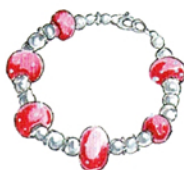
2. a bracelet