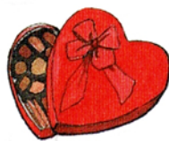
3. a box of chocolates