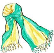
1. a scarf