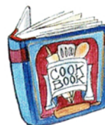
4. a cookbook