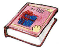
6. a book