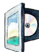
5. a DVD