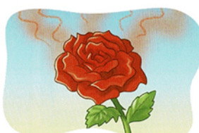
6. rose / good