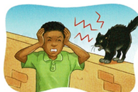
3. noise / awful

How does the butterfly look? It looks beautiful .