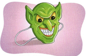
4. mask / ugly

How does the butterfly look? It looks beautiful .