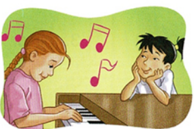
5. music / wonderful