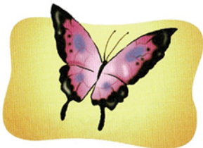
1. butterfly / beautiful