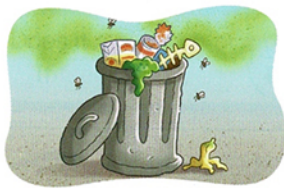
2. garbage / bad