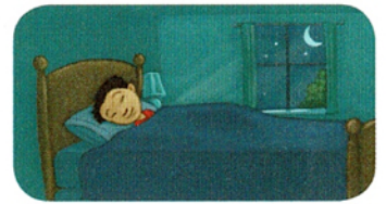
8. go to sleep