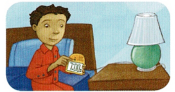
4. set the alarm