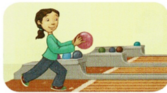
7. go bowling