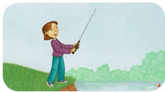
5. go fishing