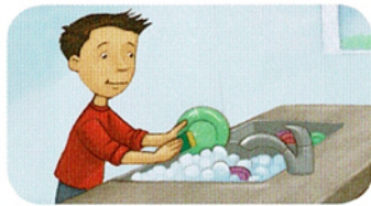
2. wash the dishes