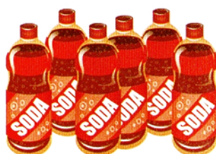
6. bottles of soda