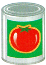
1. a can of tomatoes