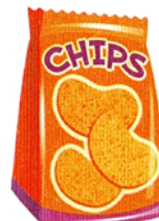
3. a bag of potato chips