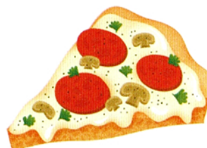
7. a piece of pizza