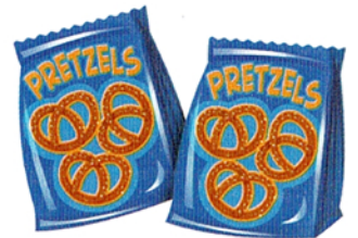
4. bags of pretzels