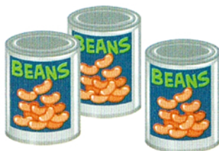
2. cans of beans