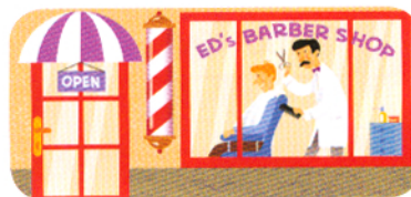
2. barber shop