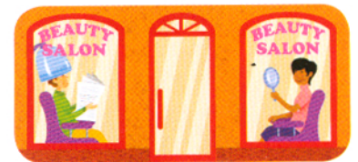
3. beauty salon