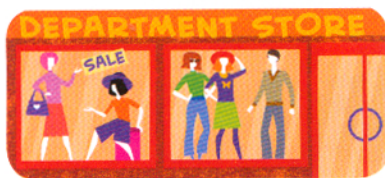
1. department store