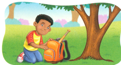
4. Put the bag under the tree.