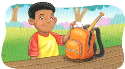
3. Put the baseball in the bag.