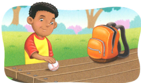
1. Put the baseball on the table.