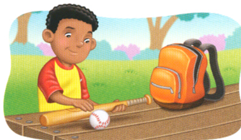
2. Put the bat by the baseball.