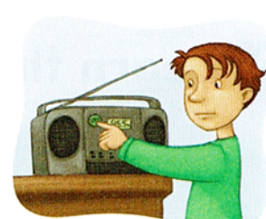
4. turn off the radio