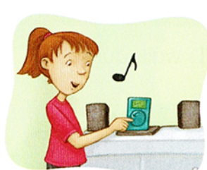
8. turn down the music