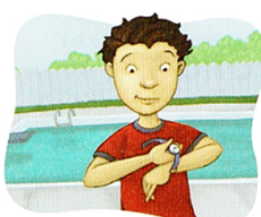
3. take off your watch