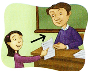
5. turn in your homework