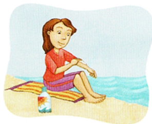
1. put on sunscreen