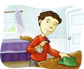
7. clean up your room