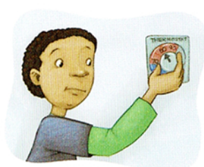
6. turn up the heat