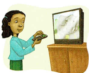
2. turn on the TV