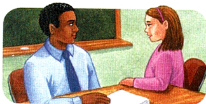
4. talking to the teacher