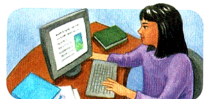
6. writing an essay