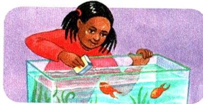
2. feeding the fish