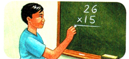
3. writing on the board