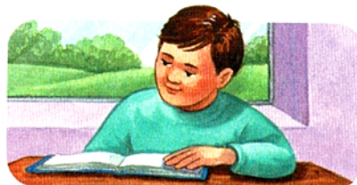
5. reading a textbook