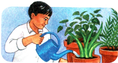
1. watering the plants