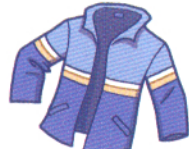
2. a jacket