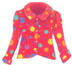
1. a blouse