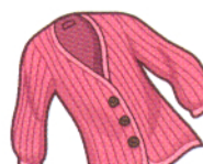
3. a sweater