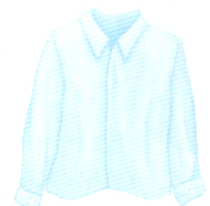
4. a shirt