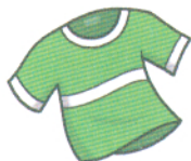
1. a T-shirt