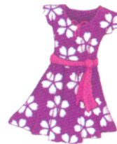
3. a dress