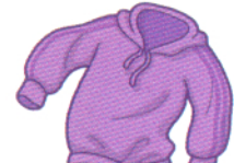
4. a sweatshirt