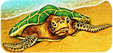
2. a sea turtle