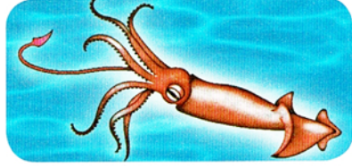
3. a squid