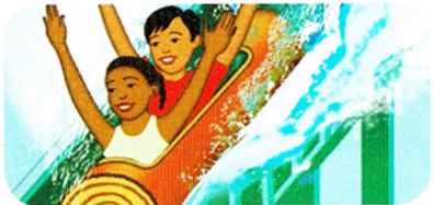
5. a ride