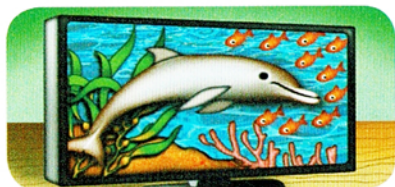
4. a video