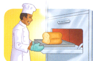
6. a baker