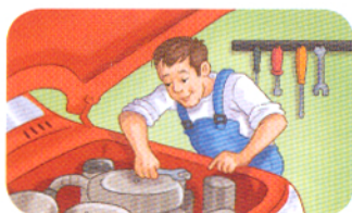
2. a mechanic