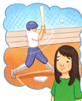
4. a baseball player