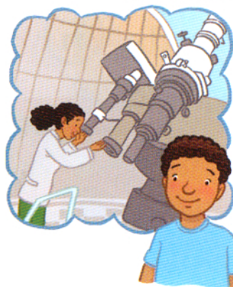
3. an astronomer