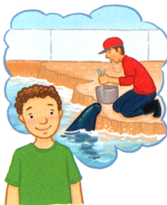
2. a zookeeper