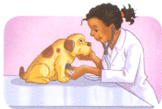
1. a veterinarian