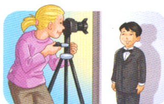
5. a photographer