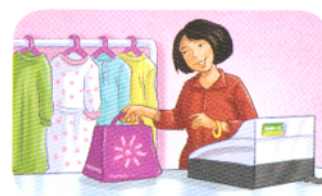
3. a salesclerk