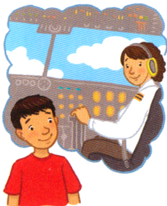
1. a pilot

What does your mother do? She's a pilot.