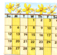
8. a calendar