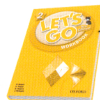
4. a workbook