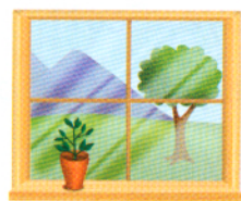
2. a window