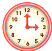
6. a clock