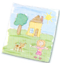
1. a picture