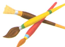
7. paint brushes