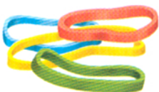
5. rubber bands