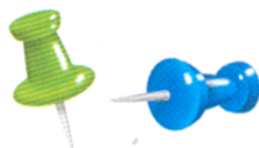
6. push pins