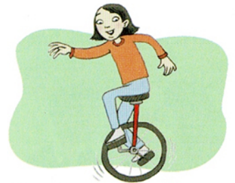
3. ride a unicycle