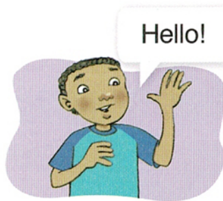
2. speak English