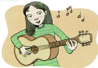
1. play the guitar