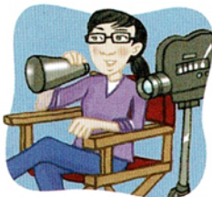
2. a movie director