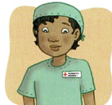
5. a surgeon