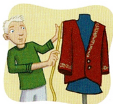
3. a designer