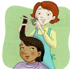
4. a hair stylist