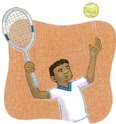
1. a tennis player