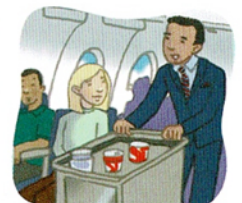
6. a flight attendant