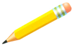
1. a pencil