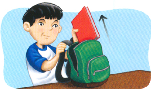
1. Take out your book.