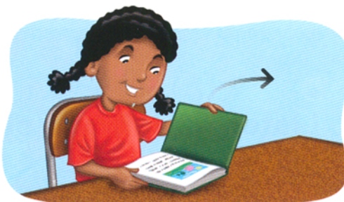
2. Open your book.