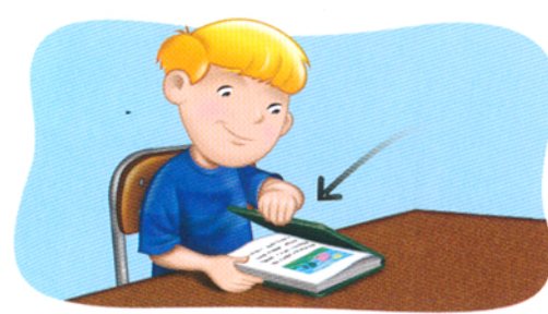
3. Close your book.