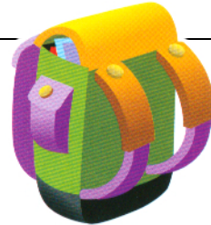
3. a bag