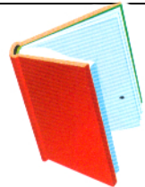
4. a book