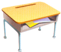
5. a desk