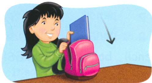
4. Put away your book.