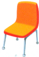
6. a chair