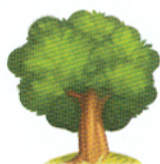
2. a tree