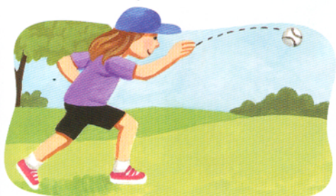
3. throw a ball