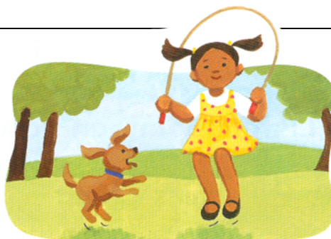
2. jump rope