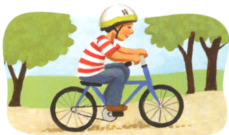
1. ride a bicycle