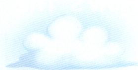
3. a cloud