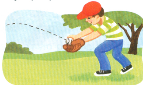
4. catch a ball