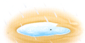
4. a puddle