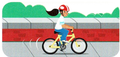
3. riding her bicycle