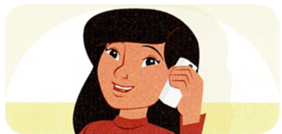
1. talking on the phone