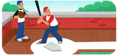
6. playing baseball