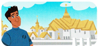
2. visiting Bangkok