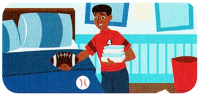
4. cleaning his room